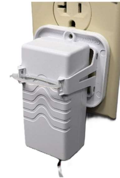
Figure 4: Power adapter and bracket, secured with zip tie.