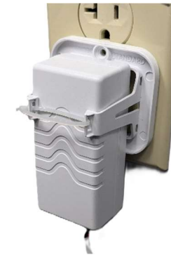
Figure 4: Power adapter and bracket, secured with zip tie.