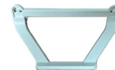
Figure 2: Countertop stand