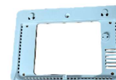
Figure 3: Wall bracket